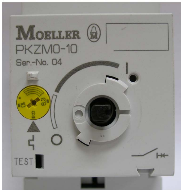
Allowed amperage adjustment dial

Step 2: Using the small phillips head screwdriver, adjust the dial to where the 8 and the arrow are aligned as demonstrated in the figures below. For optimal performance this dial should never be set below 8.